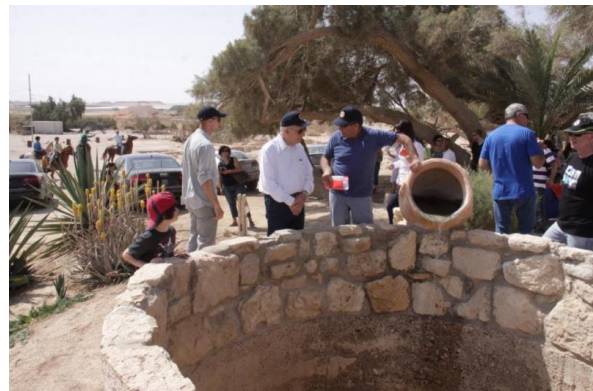
Islamic Period Site