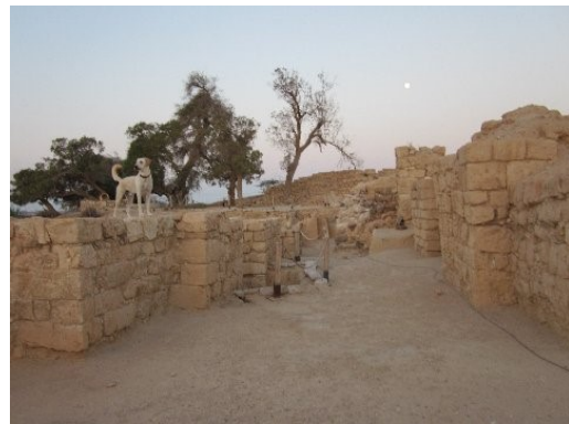
Nahmer, our watch dog welcomed me back